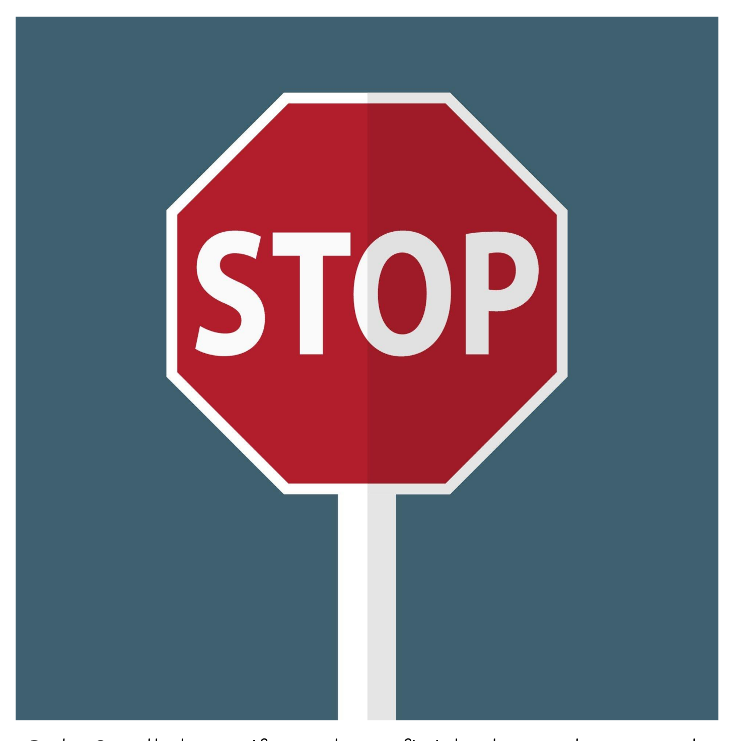
Only Scroll down if you have finished your homework.