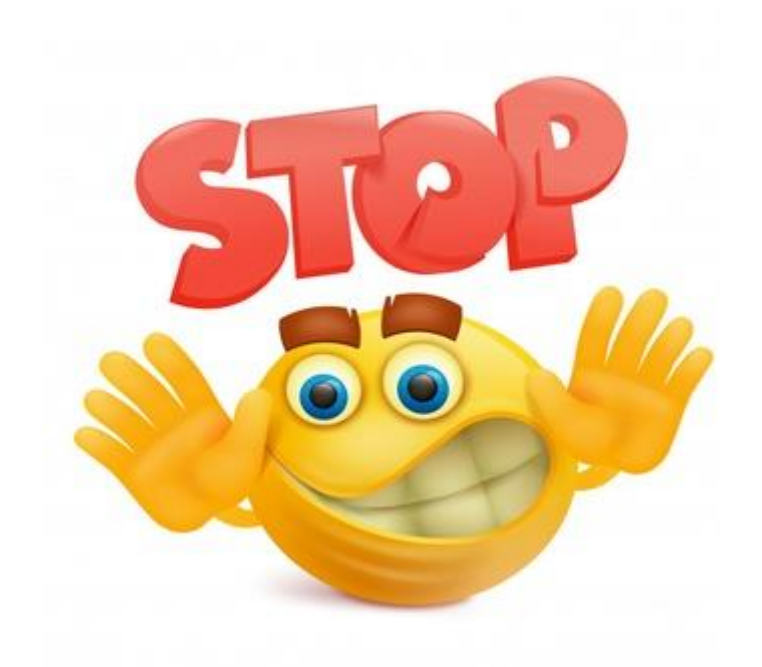
Answers to be revealed on the next page!